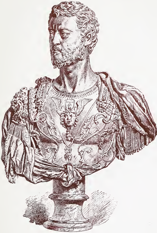
BUST OF COSIMO DE' MEDICI. Palazzo del Bargello, Florence.